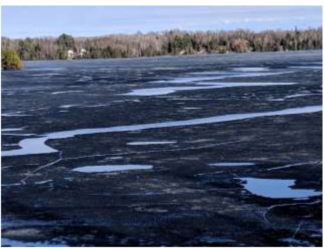
Gee Esslinger's picture captures some seriously waterlogged ice - - not your normal 'Black Ice' - shortly before ice out on NT