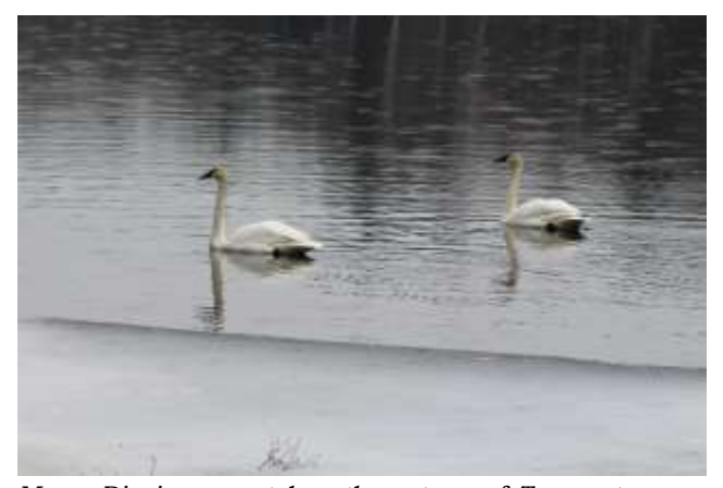
Maya Discianno catches the return of Trumpeter Swans on ST from the bridge on the divide