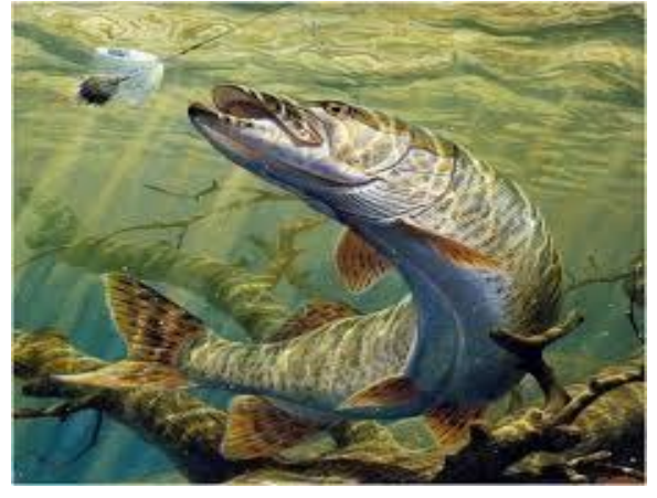
Saturday before Fathers' Day, June 19, 2021.

You will be able to register via phone, mail, email or in person to either of us as indicated below. To be eligible to participate and win, you must be a member in good standing or a guest of a member in good standing as well as be registered for the contest and have paid