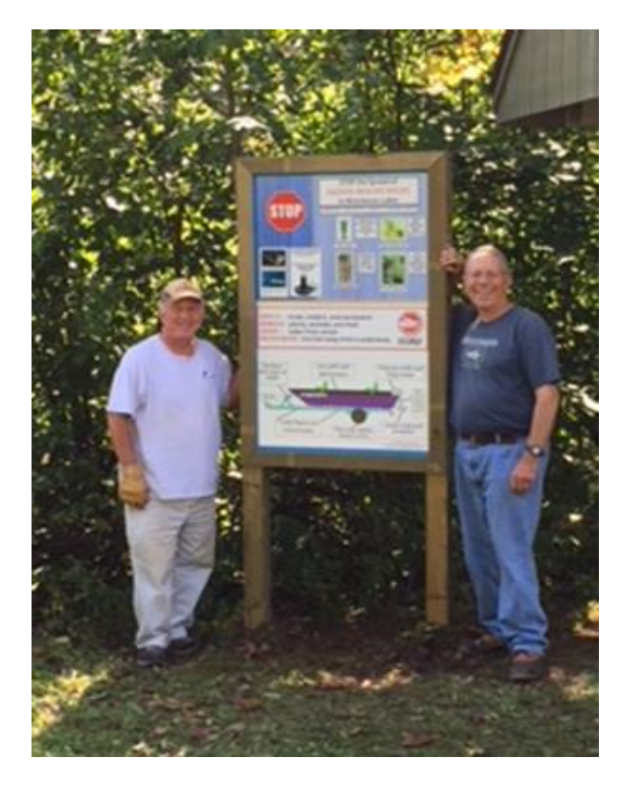
TLCA CBCW Inspectors at the Rock Creek Boat Landing

law in Wisconsin as well as looking for aquatic plant hitchhikers on boats and trailers. The CBCW program is one of our premier prevention efforts. We plan to be at the Turtle Chain boat landings periodically during the summer, especially during heavy use weekends. So far, the Turtle Chain has avoided any infestations of curly leaf pond weed or other aggressive AIS that are in the area. We would like to maintain that status.