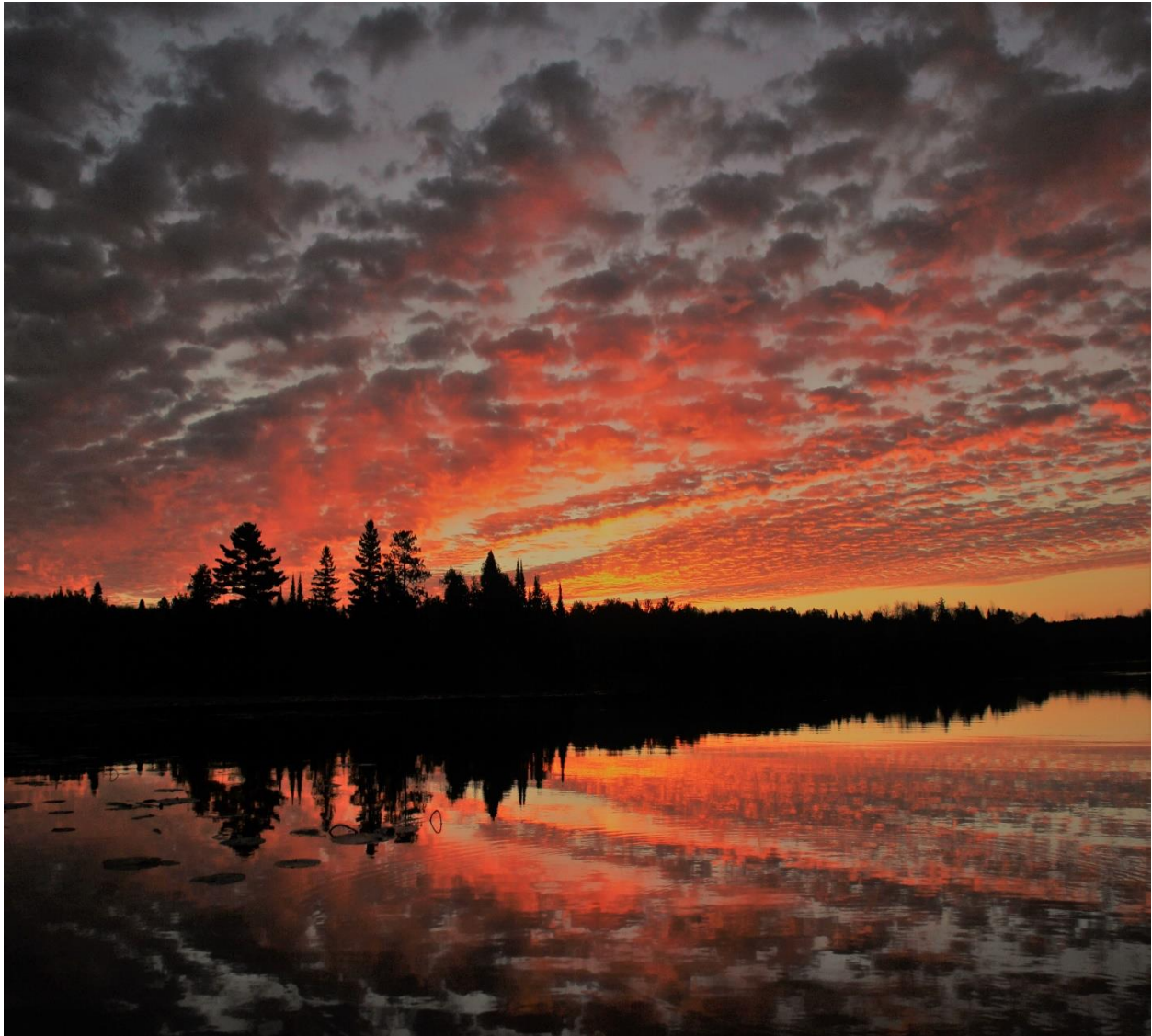
Sunrise over Rock Lake- -October 9 th , 2017