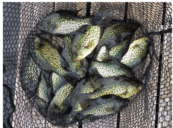
Osikowicz Family Fish Fry